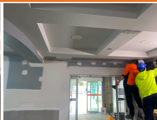
Painting is underway in Main Reception