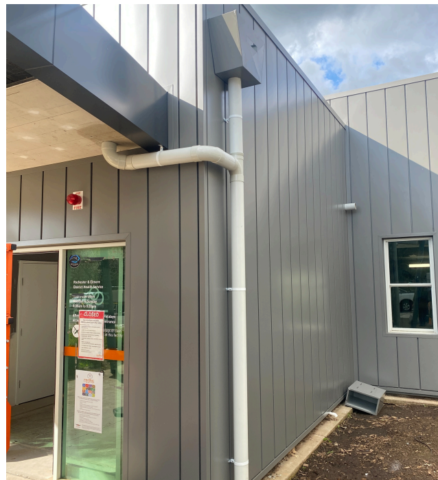
Finishing touches on the cladding