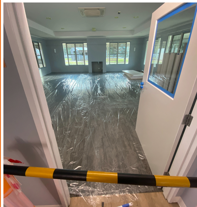
Aged Care Lounge flooring is complete