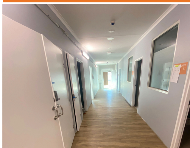
New flooring Acute Care wing

The external cladding is complete, and it is full steam ahead inside the building, with installation of new flooring and painting work.