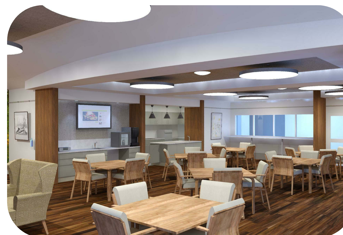
4 - DINING LOUNGE