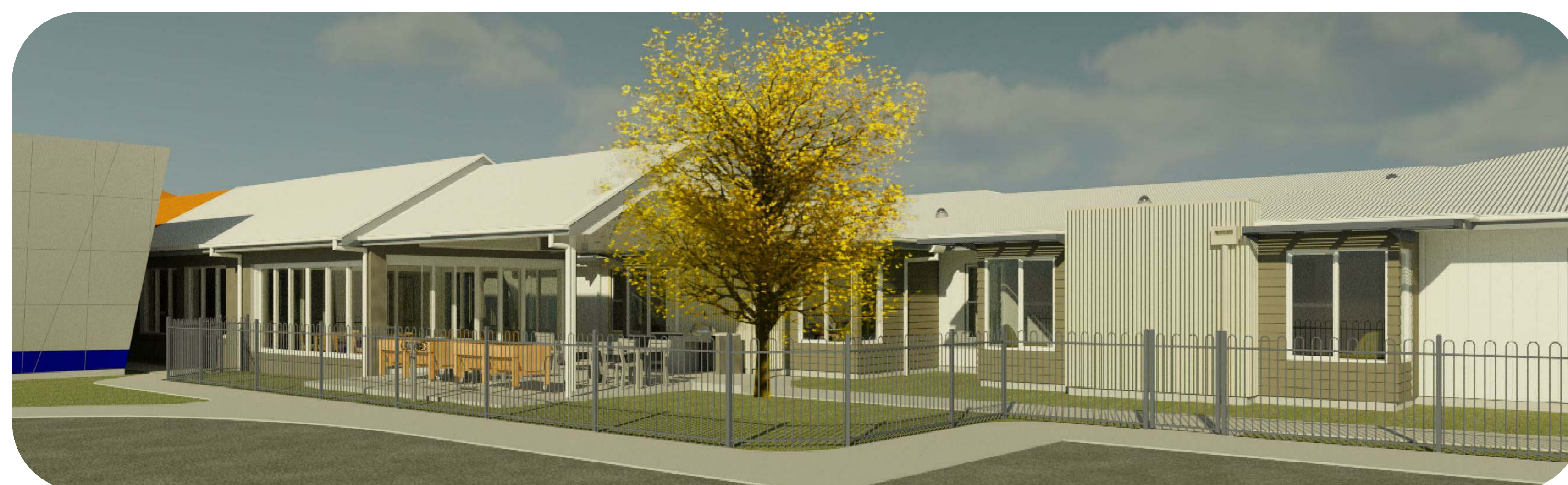
6 - EXTERNAL VIEW