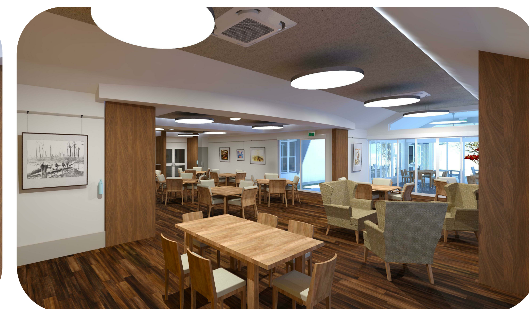
5 - DINING LOUNGE