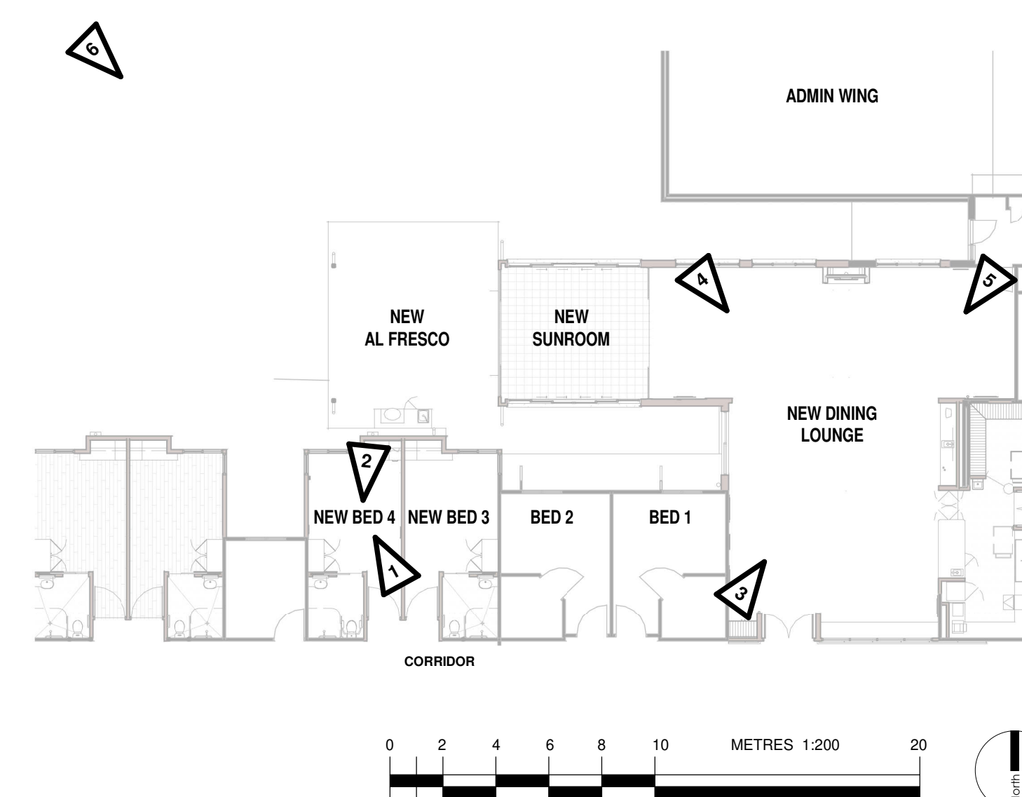
VIEW KEY PLAN