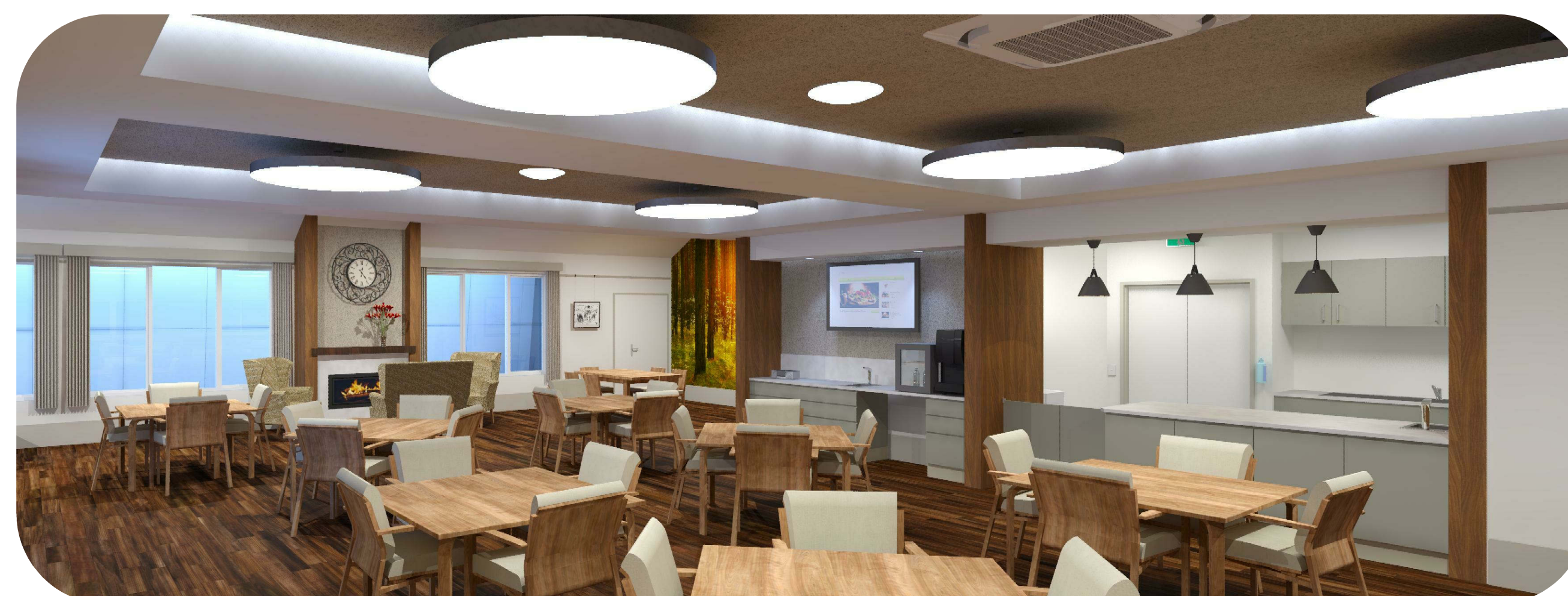
3 - DINING LOUNGE